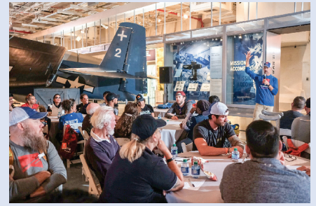
The 2018 No Barriers Summit.

Each year, CoBank customers like Grundy County REC can nominate deserving veterans interested in this challenging and inspiring program.