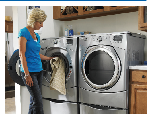
Give serious consideration as to whether to purchase an extended warranty.

Consider the average cost of a three-year