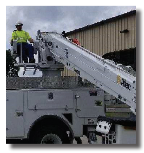
Lineman Aaron Bird completing bucket rescue competency.