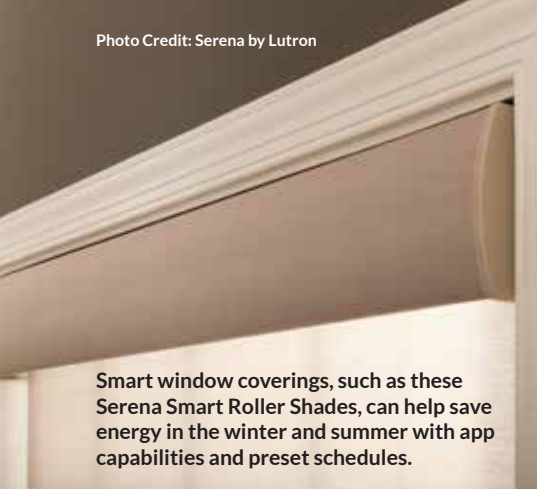
Smart window coverings, such as these Serena Smart Roller Shades, can help save energy in the winter and summer with app capabilities and preset schedules.